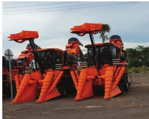
Fig. 3. Mechanical sugarcane harvester.