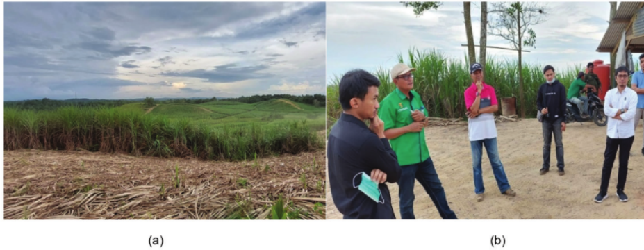
Fig. 2. (a) Sugarcane plantations on hilly land, (b) researchers discussed with sugar cane field officers.

Several new methods can accelerate sugarcane growth, such as using bacteria on a heterogeneous group of microorganisms in the rhizosphere. These microorganisms live in association with sugarcane roots, can stimulate plant growth, and can reduce disease incidence. Among many PGPRs, the most studied genera include Azospirillum , Bacillus , and Pseudomonas (dos Santos, Diaz, Lobo, & Rigobelo, 2020). Sugarcane growth can be optimized by a suitable combination of PGPRs, environmental conditions, and plant genotypes (Mehnaz, 2011). In this regard, additional efforts should be put into developing sound inoculants and production systems that reduce the amount of chemical fertilizers and insecticides used to increase soil fertility and crop productivity.